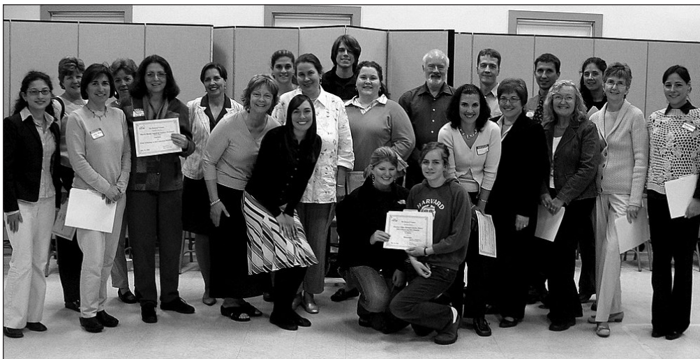
Some of the Hingham Education Foundation 2006-2007 grant recipients after receiving their grants at the Hingham Public Schools Staff Appreciation Reception.